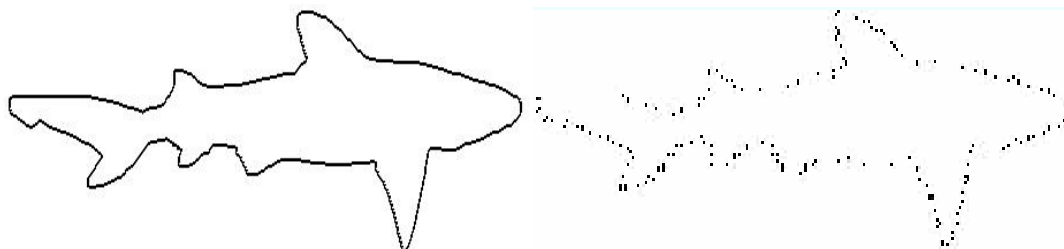
Fig-3: Illustration of the WTMM image (a) Original image (b) Its WTMM image

In general, either the complexity of the above algorithms increases exponentially as the number of candidate images increases.